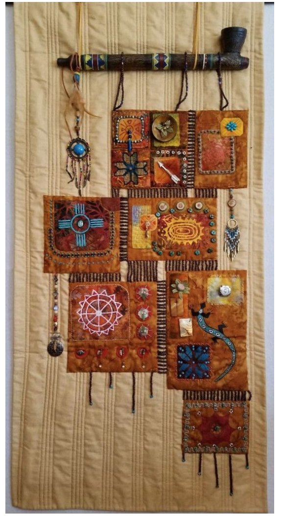
the top two: